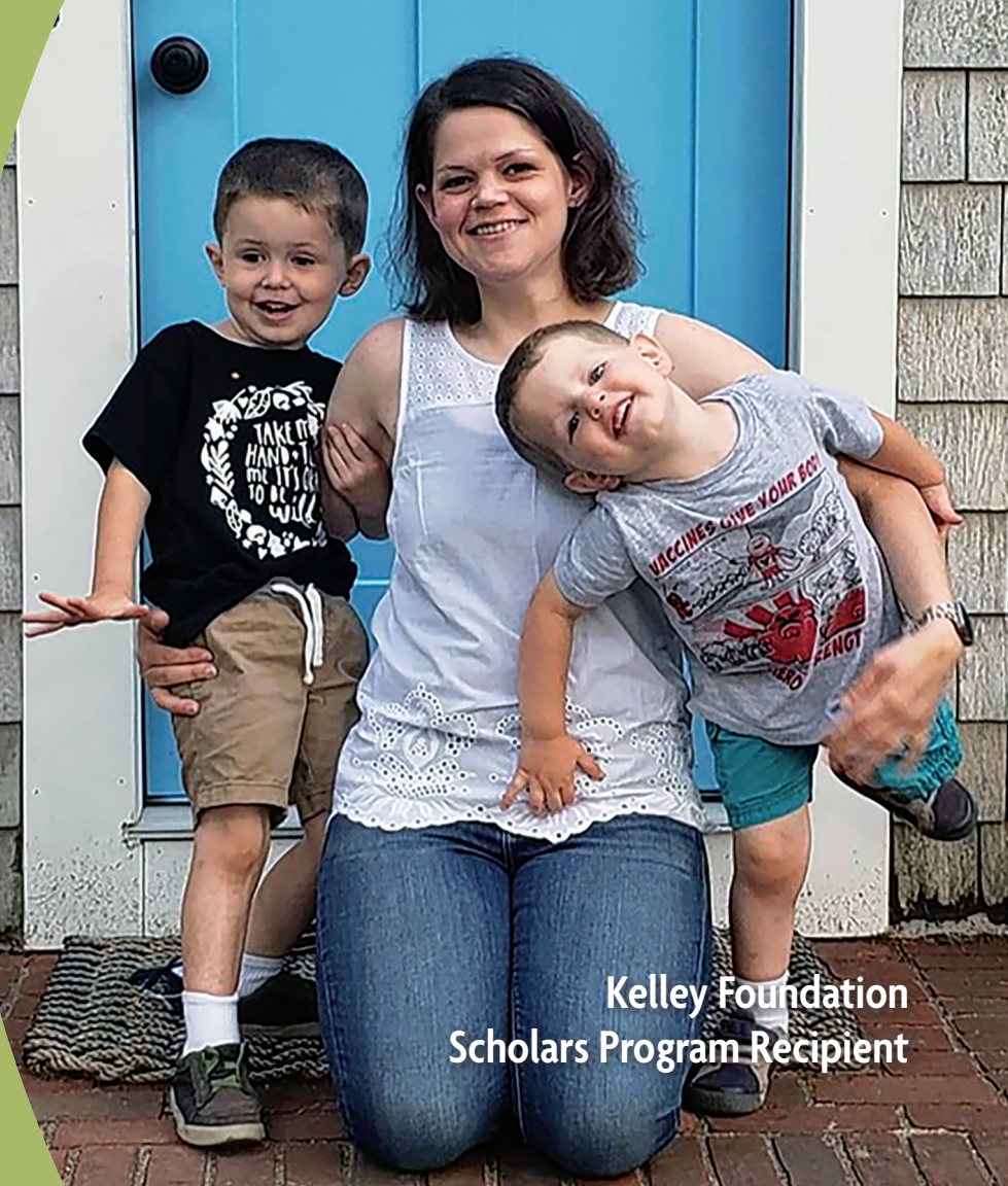
Kelley Foundation Scholars Program Recipient