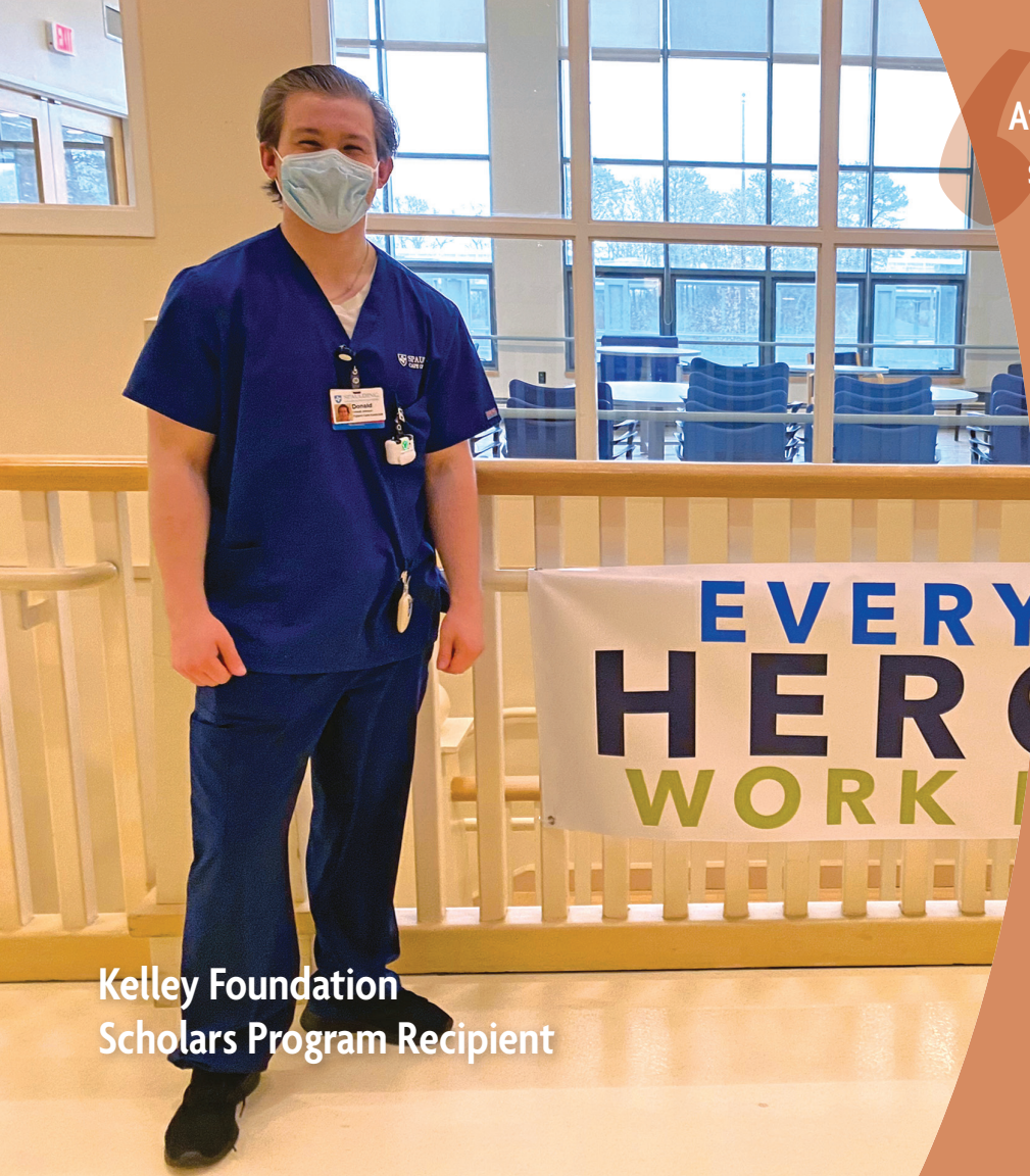
Kelley Foundation Scholars Program Recipient

At the moment, I am working two jobs to save for school, one as a CNA at Spaulding Rehabilitation Hospital and one as an Emergency Center Tech at Cape Cod Hospital. I am also enrolled in a Pharmacology Class for the summer. Without this scholarship, I would have to work very long shifts or back-to-back shifts to make ends meet with my tuition and other life expenses. However, because of this very generous scholarship, I will be able to work less and be able to focus on my schooling more to ensure I am the most competent nurse I could possibly be... My dream job would be working on Cape Cod as a Nurse Practitioner.